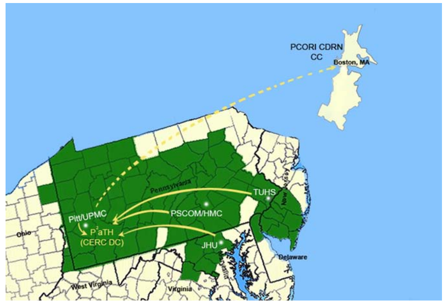
Figure 1 The population demographic area of seven Mid-Atlantic States that are currently receiving care and participate in the PaTH network.